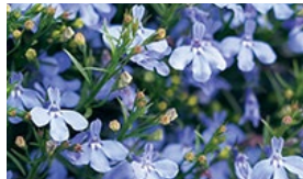
Laguna® Lobelia Series