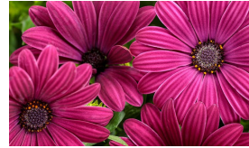
Bright Lights™ Osteospermum Series