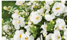
Snowstorm® Sutera Series