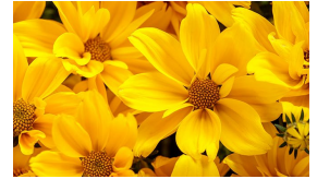
Goldilocks Rocks® Bidens