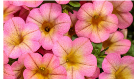
Superbells® Calibrachoa Series