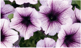
Supertunia® Petunia Series