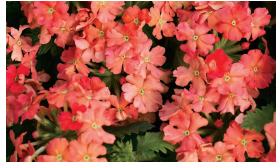
Superbena® Royale Verbena Series