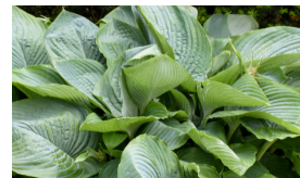
Shadowland® 'Empress Wu' Hosta