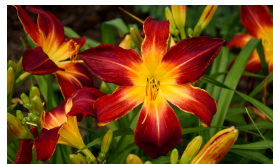
Rainbow Rhythm® 'Ruby Spider' Hemerocallis