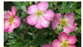
Happy Face® Potentilla Series