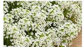
Snow Princess® Lobularia