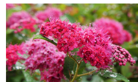
Double Play® Spirea Series