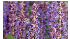
Color Spires® 'Violet Riot' Salvia