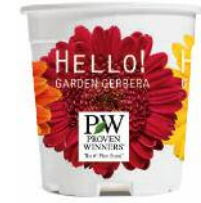
Proven Winners Hello! Garden Gerbera Royale™ Container 128 units per case 48 cases per pallet