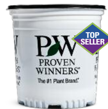
Perennial Trade Gallon Container