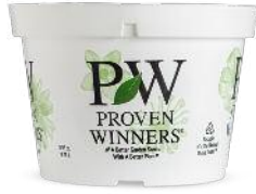
8.5 Jumbo Container* 130 units per case 60 cases per pallet