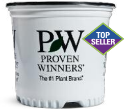
Perennial Premium 1 Gallon Container 85 units per case 64 cases per pallet