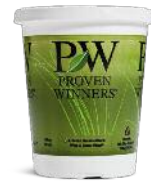
Proven Winners Self-Symetricize® Grasses Grande™ Container 440 units per case 40 cases per pallet