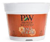
Proven Winners Fall Color 6.5 Container 240 units per case 48 cases per pallet