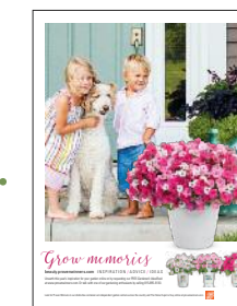
Print ad campaign – 7 million magazine subscribers