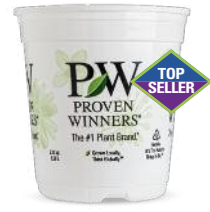
1.0 GL Royale™ Container 128 units per case 48 cases per pallet