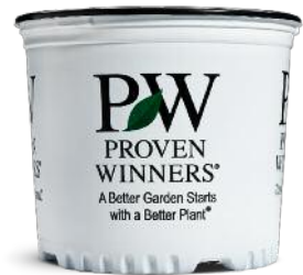
Perennial Premium 3 Gallon Container 71 units per case 32 cases per pallet