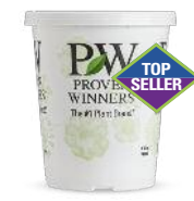
4.25 Grande™ Self-Symetricize® Container 440 units per case 40 cases per pallet