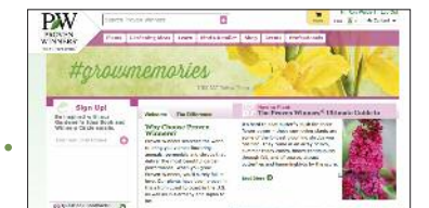
Website – 11.6+ million page views