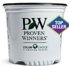
Flowering Shrubs Premium 1 Gallon Container 85 units per case 64 cases per pallet