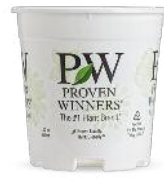
1.0 Quart Container 475 units per case 33 cases per pallet