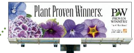
Billboards – 52 million impressions