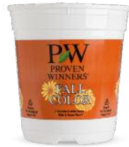
Proven Winners Fall Color Royale™ Container 128 units per case 48 cases per pallet