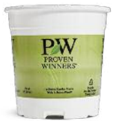
Proven Winners Grasses 1.0 Quart Container 475 units per case 33 cases per pallet