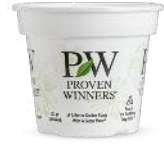
4.50 Classic™ Self-Symetricize® Container 1050 units per case 40 cases per pallet