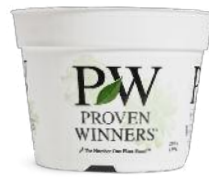
6.5 Container 240 units per case 48 cases per pallet