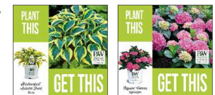
Social Media – 303,000+ followers