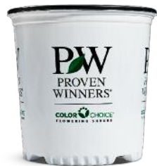
Flowering Shrubs Premium 2 Gallon Container 90 units per case 46 cases per pallet