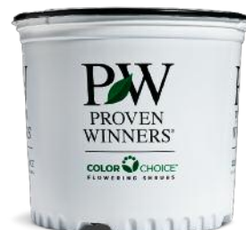
Flowering Shrubs Premium 3 Gallon Container 71 units per case 32 cases per pallet