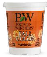
Proven Winners Self-Symetricize® Fall Color Grande™ Container 440 units per case 40 cases per pallet