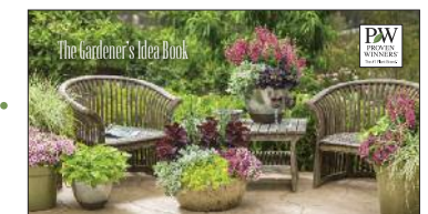
Gardener's Idea Book – 350,000 requests