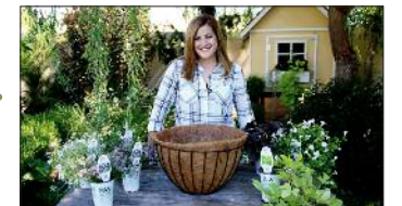
Garden AnswerYouTube – 268 million views