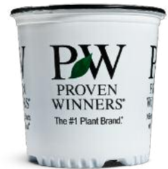
Perennial Premium 2 Gallon Container 90 units per case 46 cases per pallet