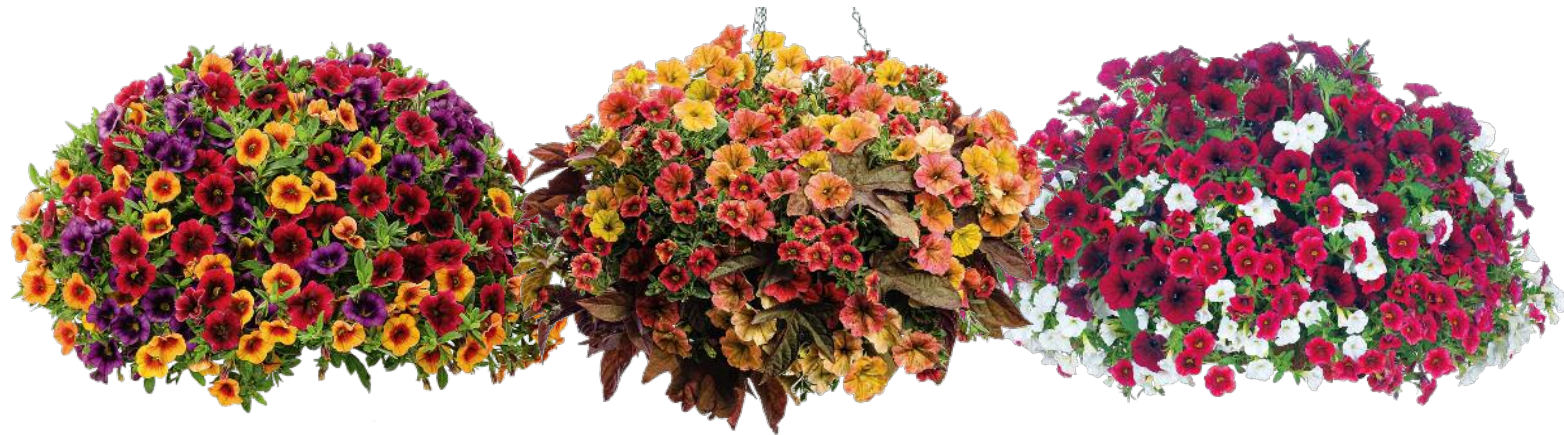
37. Summer Punch Superbells® Apricot Punch™ Calibrachoa Superbells® Grape Punch™ Calibrachoa Superbells® Pomegranate Punch™ Calibrachoa