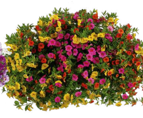
5. Candyland Superbells® Dreamsicle™ Calibrachoa Superbells® Pink Calibrachoa Superbells® Yellow Calibrachoa