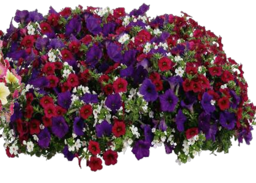
36. Patriotic Moment Superbells® Cherry Red Calibrachoa Supertunia® Royal Velvet™ Petunia Snowstorm® Snow Globe® Sutera