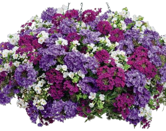
Best Friend SNOWSTORM® Snow Globe® Sutera SUPERBENA® Royale Plum Wine Verbena SUPERBENA® Violet Ice Verbena