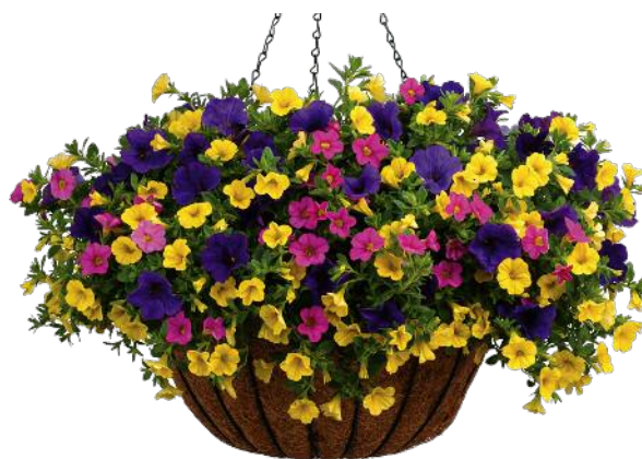
25. The North Shore Superbells® Pink Calibrachoa Superbells® Yellow Calibrachoa Supertunia® Royal Velvet™ Petunia