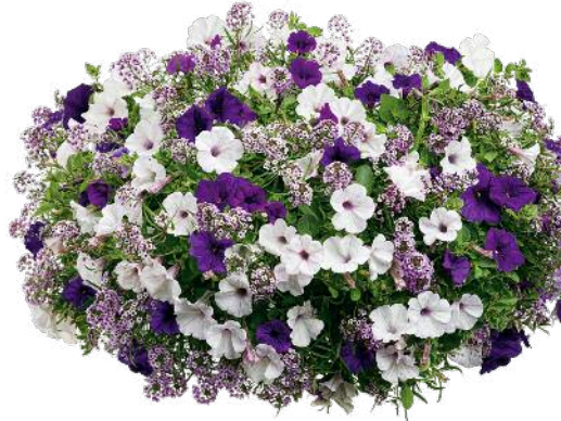
7. Velvet Skies (2013 National Recipe) Blushing Princess® Lobularia Supertunia® Mini Silver Petunia Supertunia® Royal Velvet™ Petunia