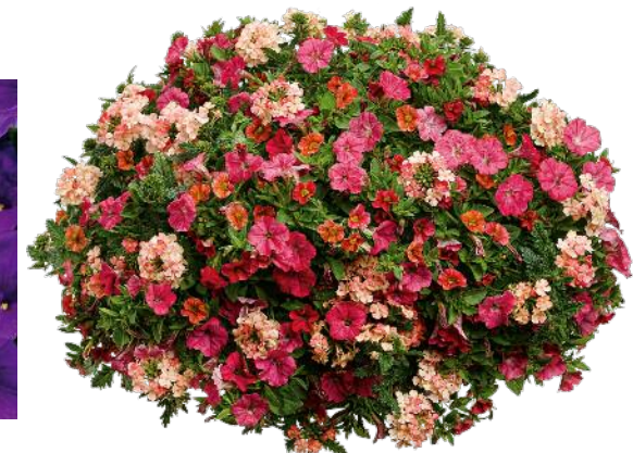
33. Southern Hospitality Superbells® Dreamsicle™ Calibrachoa Supertunia® Really Red Petunia Superbena® Royale Peachy Keen Verbena