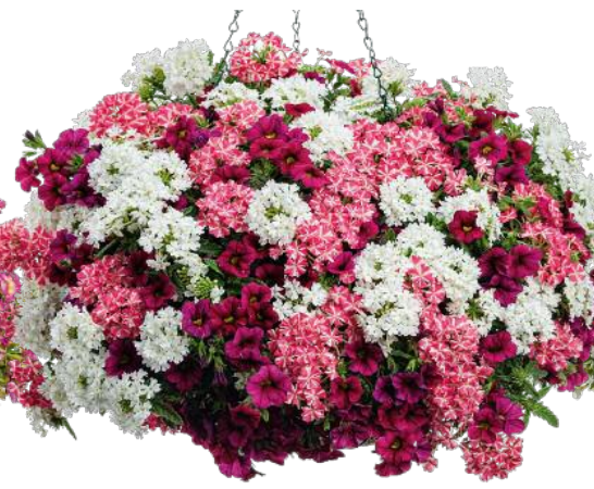
So Sweet SUPERBELLS® Cherry Red Calibrachoa SUPERBENA® Royale Cherryburst Verbena SUPERBENA® Royale Whitecap Verbena