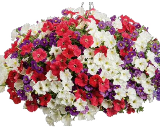
With Liberty SUPERBELLS® Grape Punch™ Calibrachoa SUPERTUNIA® Really Red Petunia SUPERTUNIA® White Petunia