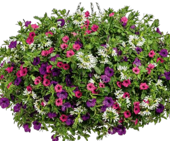
Grandiose SUPERTUNIA® Indigo Charm Petunia SUPERTUNIA® Sangria Charm Petunia WHIRLWIND® White Scaevola