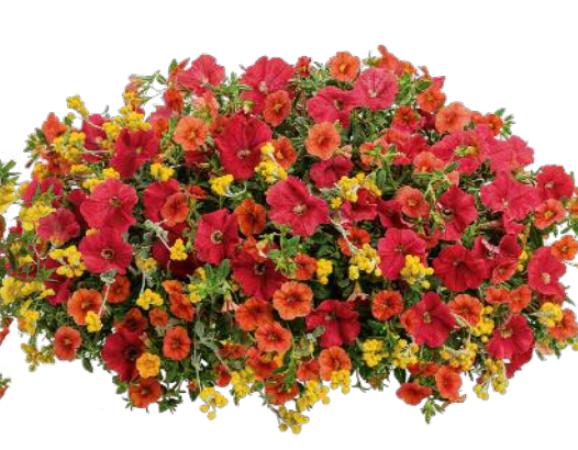
6. Backyard BBQ (2017 National Recipe) Superbells® Dreamsicle™ Calibrachoa Flambé® Yellow Chrysocephalum Supertunia® Really Red Petunia