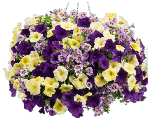
22. Afternoon Tea Superbells® Evening Star™ Calibrachoa Supertunia® Limoncello™ Petunia Supertunia® Royal Velvet™ Petunia