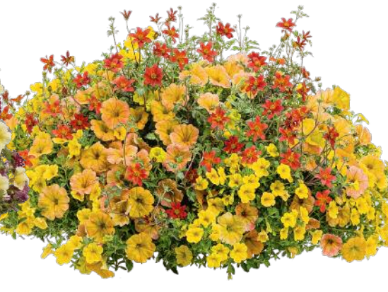
20. Honeybelle Campfire® Fireburst Improved Bidens Superbells® Yellow Calibrachoa Supertunia® Honey™ Petunia