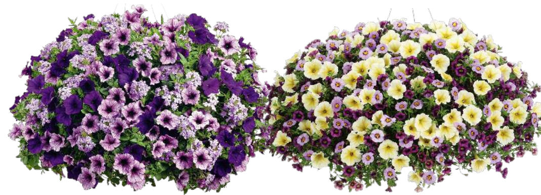
46. Geneva Terrace Supertunia® Bordeaux™ Petunia Supertunia® Royal Velvet™ Petunia Superbena® Large Lilac Blue Verbena