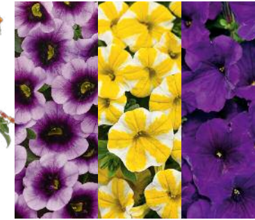
32. Once in a Blue Moon Superbells® Blue Moon Punch™ Calibrachoa Superbells® Lemon Slice™ Calibrachoa Supertunia® Royal Velvet™ Petunia