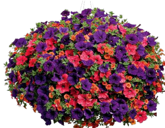
27. Livin' on the Edge Superbells® Dreamsicle™ Calibrachoa Supertunia® Really Red Petunia Supertunia® Royal Velvet™ Petunia