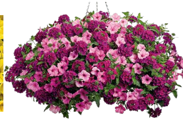
29. Hit It Big Supertunia® Vista Bubblegum® Petunia Superbena® Burgundy Verbena