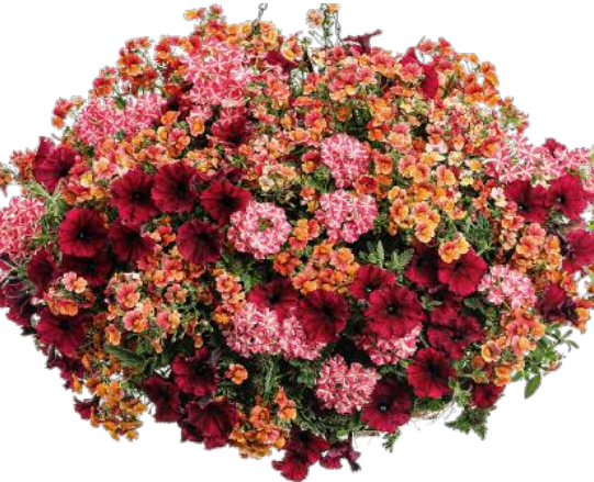
Mix It Up SUNSATIA® Blood Orange™ Nemesia SUPERTUNIA® Black Cherry™ Petunia SUPERBENA® Royale Cherryburst Verbena