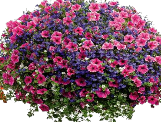
17. New Attitude Lucia® Dark Blue Lobelia Supertunia® Mini Strawberry Pink Veined Petunia Snowstorm® Giant Snowflake® Sutera