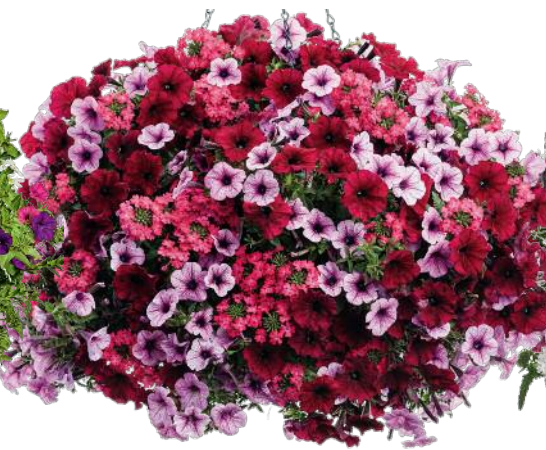
Tons of Fun SUPERTUNIA® Black Cherry™ Petunia SUPERTUNIA® Mini Rose Veined Petunia SUPERBENA® Royale Iced Cherry Verbena