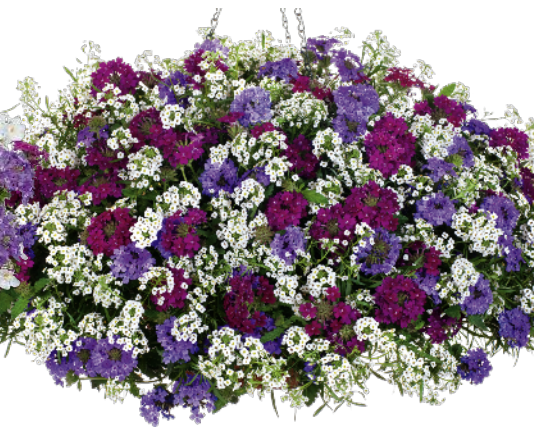
Her Majesty SNOW PRINCESS® Lobularia SUPERBENA® Royale Chambray Verbena SUPERBENA® Royale Plum Wine Verbena