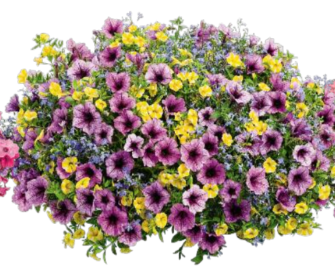
2. Bahama Beach (2015 National Recipe) Superbells® Lemon Slice™ Calibrachoa Laguna™ Sky Blue Lobelia Supertunia® Bordeaux™ Petunia