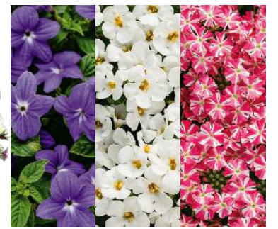
48. Burst of Inspiration Endless™ Illumination Browallia Snowstorm® Snow Globe® Sutera Superbena® Royale Cherryburst Verbena