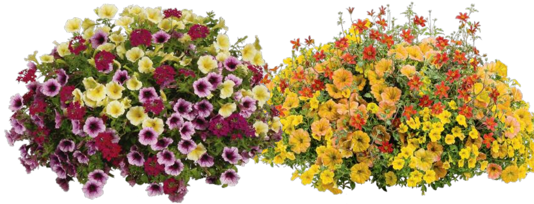
19. Girl's Night Out Supertunia® Bordeaux™ Petunia Supertunia® Limoncello™ Petunia Superbena® Royale Plum Wine Verbena