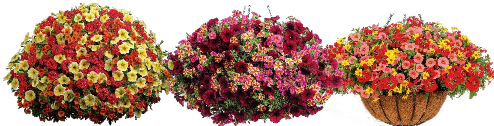
43. Patrick's Punch Superbells® Dreamsicle™ Calibrachoa Supertunia® Limoncello™ Petunia Tukana® Scarlet Star Verbena