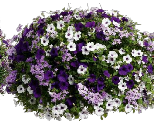
8. Lively in Lavender Supertunia® Mini Blue Veined Petunia Supertunia® Royal Velvet™ Petunia Superbena® Large Lilac Blue Verbena