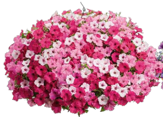
1. Above & Beyond (2017 National Recipe) Supertunia® Vista Bubblegum™ Petunia Supertunia® Vista Fuchsia Petunia Supertunia® Vista Silverberry Petunia