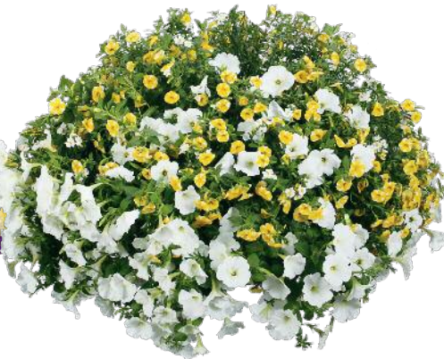
23. Banana Colada Superbells® Lemon Slice™ Calibrachoa Sunsatia® Coconut Nemesia Supertunia® White Petunia