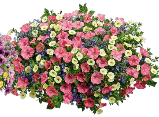
3. Bermuda Skies (2012 National Recipe) Superbells® Yellow Chiffon™ Calibrachoa Laguna™ Sky Blue Lobelia Supertunia® Bermuda Beach™ Petunia