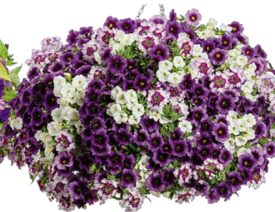
Avalon SUPERBELLS® Grape Punch™ Calibrachoa SUPERBELLS® White Calibrachoa SUPERBENA® Sparkling Amethyst Verbena