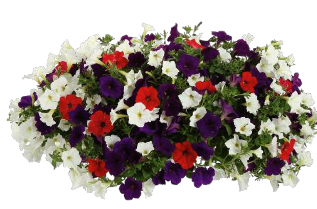
13. Main Street USA Supertunia® Mini White Petunia Supertunia® Royal Velvet™ Petunia Surfinia® Red Petunia