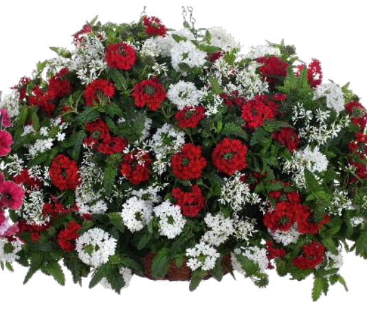
Love Song DIAMOND FROST® Euphorbia SUPERBENA® Royale Red Verbena SUPERBENA® Royale Whitecap Verbena