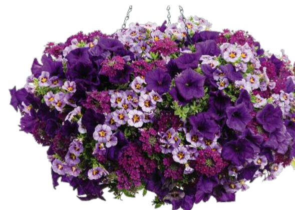
34. Ada Superbells® Evening Star™ Calibrachoa Supertunia® Royal Velvet™ Petunia Superbena® Royale Plum Wine Verbena