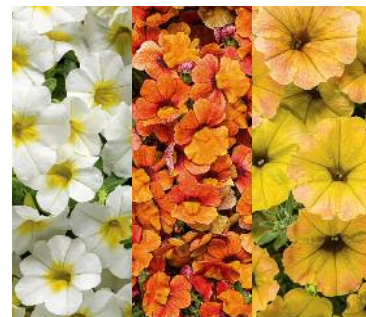
26. Afternoon Bliss Superbells® Over Easy™ Calibrachoa Sunsatia® Blood Orange™ Nemesia Supertunia® Honey™ Petunia