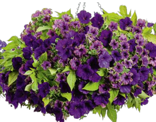
Believe in Fairies 'Sweet Caroline Light Green' Ipomoea SUPERTUNIA® Picasso in Blue® Petunia SUPERTUNIA® Royal Velvet™ Petunia