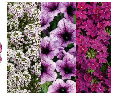
30. Summer Sangria Blushing Princess® Lobularia Supertunia® Bordeaux™ Petunia Superbena® Royale Plum Wine Verbena