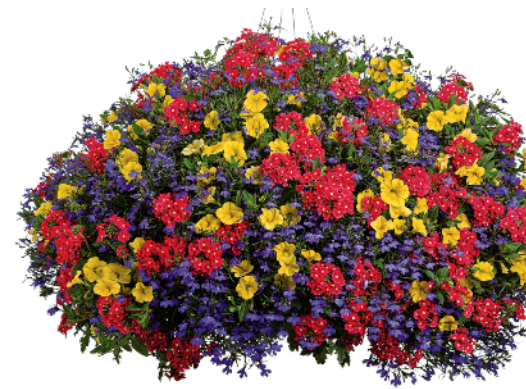
10. Santa Belle Superbells® Yellow Calibrachoa Lucia® Dark Blue Lobelia Tukana® Scarlet Verbena