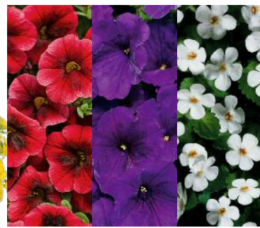
21. Royal Punch Superbells® Pomegranate Punch™ Calibrachoa Supertunia® Royal Velvet™ Petunia Snowstorm® Giant Snowflake® Sutera