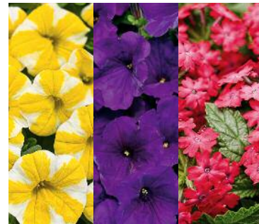
24. Berrylicious Superbells® Lemon Slice™ Calibrachoa Supertunia® Royal Velvet™ Petunia Superbena® Royale Iced Cherry Verbena