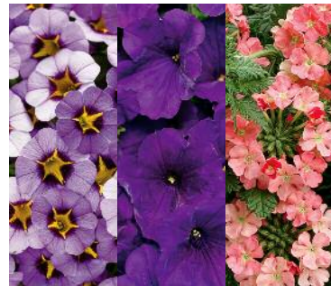
42. Cosmic Cool Superbells® Evening Star™ Calibrachoa Supertunia® Royal Velvet™ Petunia Superbena® Royale Peachy Keen Verbena