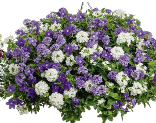
Out of the Blue ENDLESS™ Illumination Browallia SUPERBENA® Royale Chambray Verbena SUPERBENA® Royale Whitecap Verbena