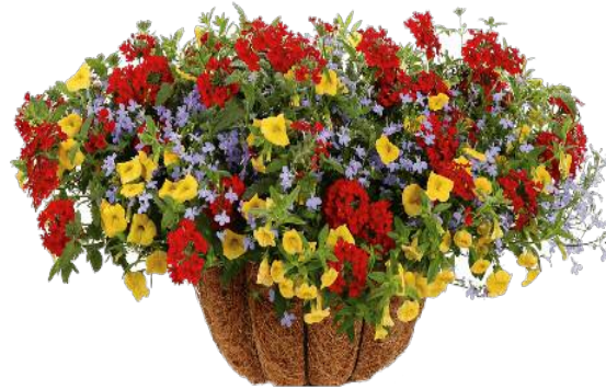
40. Aladdin's Lamp Superbells® Yellow Calibrachoa Laguna™ Sky Blue Lobelia Superbena® Royale Red Verbena