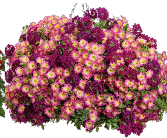
Heart to Heart SUPERTUNIA® Daybreak Charm Petunia SUPERBENA® Royale Plum Wine Verbena