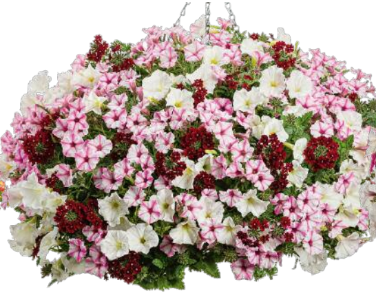
Sweet Secrets SUPERTUNIA® Pink Star Charm Petunia SUPERTUNIA® White Petunia SUPERBENA® Royale Romance Verbena