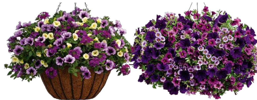
49. Wine Country Superbells® Yellow Chiffon™ Calibrachoa Supertunia® Bordeaux™ Petunia Superbena® Royale Plum Wine Verbena