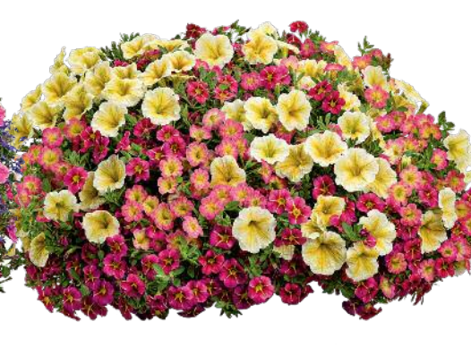
18. Aloha Superbells® Cherry Star® Calibrachoa Superbells® Sweet Tart™ Calibrachoa Supertunia® Limoncello™ Petunia