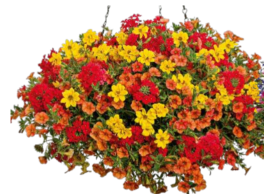
16. Fired Up! Goldilocks Rocks® Bidens Superbells® Dreamsicle™ Calibrachoa Superbena® Royale Red Verbena