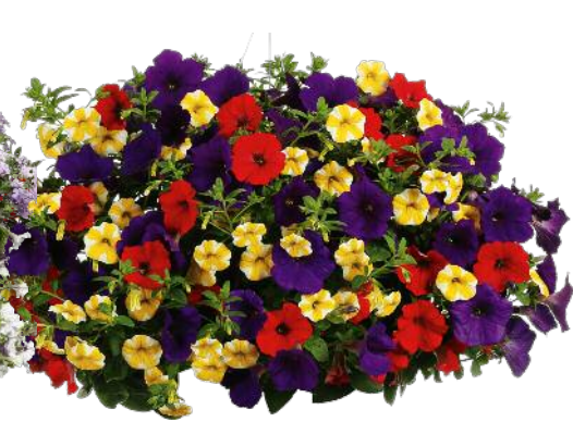
9. Starry Night Superbells® Lemon Slice™ Calibrachoa Supertunia® Royal Velvet™ Petunia Surfinia® Red Verbena