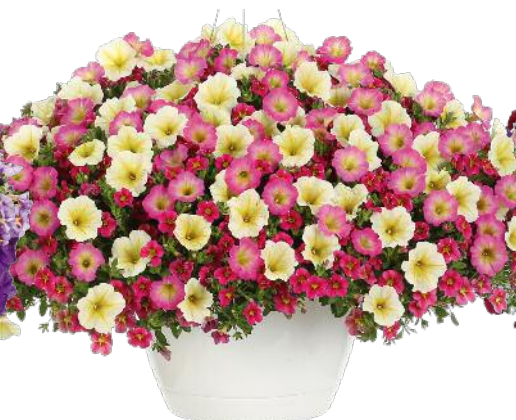
35. Hula Dancer Superbells® Cherry Star® Calibrachoa Supertunia® Daybreak Charm Petunia Supertunia® Limoncello™ Petunia