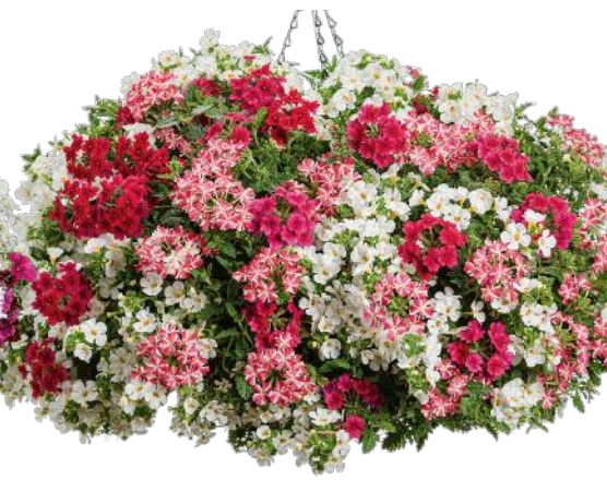
Homemade Happiness SNOWSTORM® Snow Globe® Sutera SUPERBENA® Royale Cherryburst Verbena SUPERBENA® Royale Iced Cherry Verbena