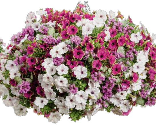
Darlin' PURPLE CHABLIS™ Lamium SUPERTUNIA® Mini Silver Petunia SUPERTUNIA® Picasso in Purple™ Petunia