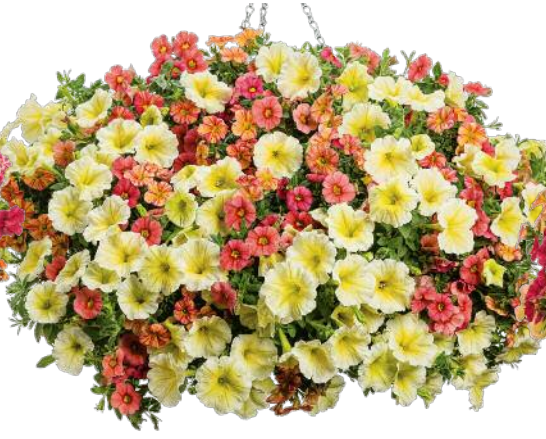
Smiling Faces SUPERBELLS® Coralina Calibrachoa SUPERBELLS® Tropical Sunrise Calibrachoa SUPERTUNIA® Limoncello™ Petunia