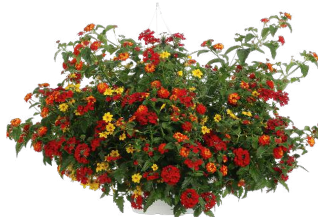
31. Summer Breeze Goldilocks Rocks® Bidens Luscious® Citrus Blend™ Lantana Superbena® Royale Red Verbena