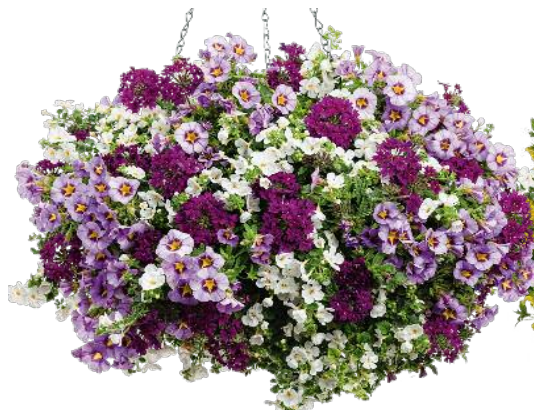
4. Evening Breeze (2016 National Recipe) Superbells® Evening Star™ Calibrachoa Snowstorm® Snow Globe® Sutera Superbena® Royale Plum Wine Verbena