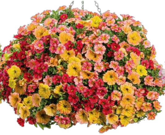
Joy SUPERBELLS® Red Calibrachoa SUPERBELLS® Tropical Sunrise Calibrachoa SUPERTUNIA® Honey™ Verbena