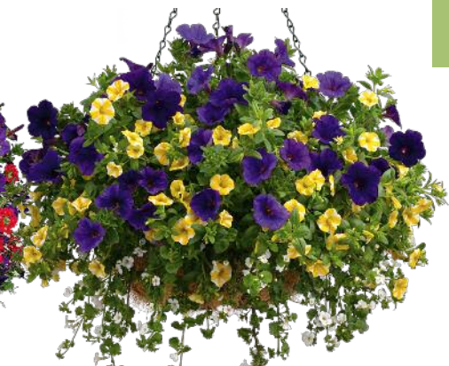
12. Plum Crazy Superbells® Lemon Slice™ Calibrachoa Snowstorm® Giant Snowflake® Sutera Supertunia® Royal Velvet™ Petunia