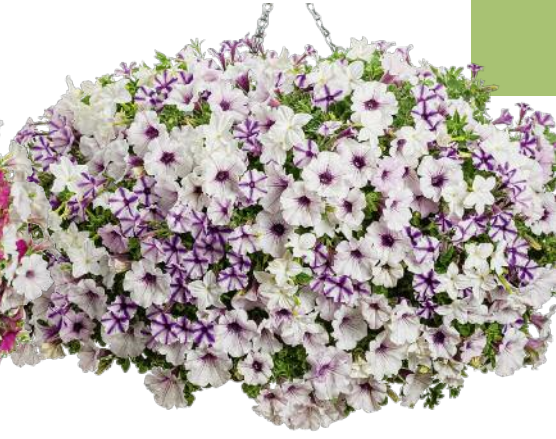
Chasing Clouds ENDLESS® Flirtation Browallia SUPERTUNIA® Mini Blue Veined Petunia SUPERTUNIA® Violet Star Charm Petunia