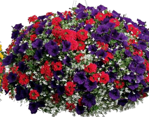
11. Fireworks Laguna™ White Lobelia Supertunia® Royal Velvet™ Petunia Superbena® Royale Red Verbena