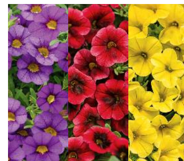
28. Mexican Festival Superbells® Blue Calibrachoa Superbells® Pomegranate Punch™ Calibrachoa Superbells® Yellow Calibrachoa