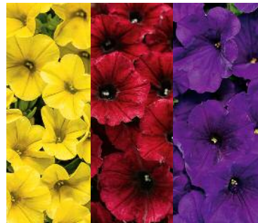
41. Starry Sunset Superbells® Yellow Calibrachoa Supertunia® Black Cherry™ Petunia Supertunia® Royal Velvet™ Petunia