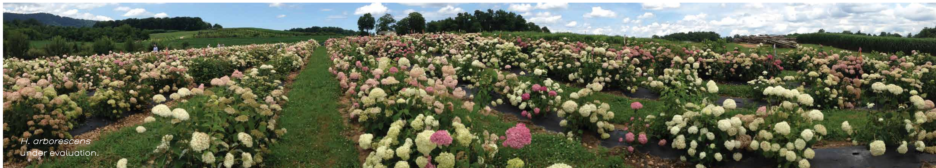
H. arborescens under evaluation.